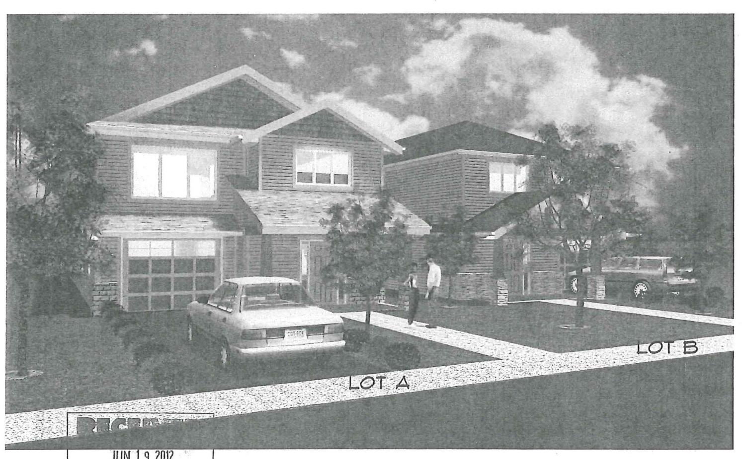
JUN 1 9 2012 PA SOO CITY OF NANAIMO DEVELOPMENT SERVICES